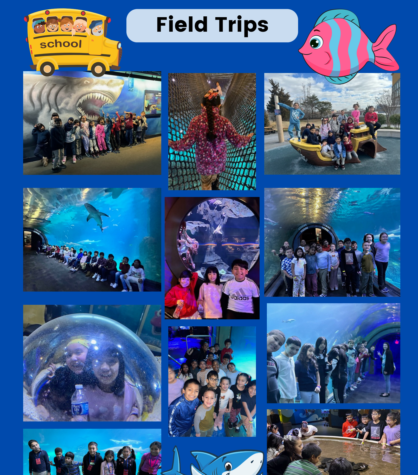
Second Grade and Fourth Grade both went on field trips to the Adventure Aquarium in Camden, NJ.